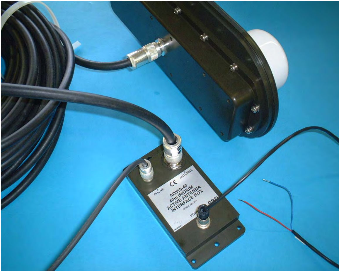
Figure 3. AD510-40 voltage regulator and break-in for use with +9 to 36Vdc supply. The case is hard anodised aluminium and has fixing flanges. A 40m coil of RG213U cable is shown connected to an AD510-10 active antenna (top). The handset interconnect is shown trailing from the TNC to the bottom left, whilst the flying lead for connection to 9 to 36V dc supply is shown cutting the frame to the right.