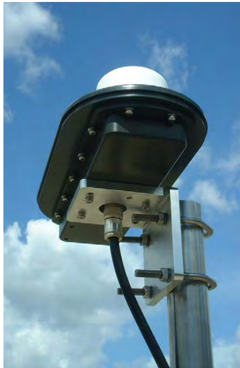
Figure 2. AD510-10 active Iridium antenna with mounting bracket and RG213U coaxial down-lead