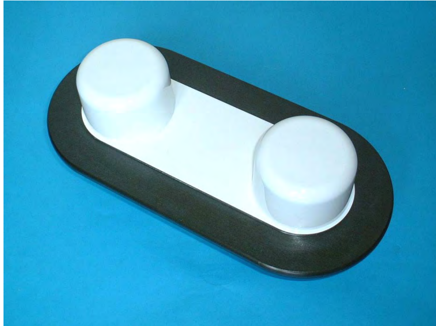
Figure 1. AD510-10 Active Iridium antenna